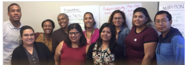
Cohort One of the Care Navigator Apprenticeship Program

“My cousin has a friend who is a community health worker and gave me the information about the program. Word of mouth is what works for the recruitment. You know your friends, you know who has the heart for this kind of work.”