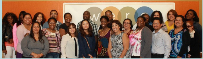
WERC's Community Health Worker Program

WERC's Community Health Worker Program is founded in the ideals of cultural affinity and team-based care. It began in 2014 as a demonstration project to improve quality of life for LA's most high-risk Medicaid patient populations while reducing emergency room and avoidable hospitalization rates in LA County Department of Health Services (LA DHS) hospitals. LA DHS has adopted a patient-centered medical home model that relies on integrated, multidisciplinary healthcare delivery teams. These medical home teams work with the five to ten percent of Medicaid patients (19,000-38,000 individuals) with chronic health conditions that result in high utilization of healthcare. Many of these individuals also face complex socioeconomic barriers to proper care. 8 Over 11,000 patients required more intensive engagement than clinical staff alone could deliver. 9 These higher-risk patients had a median age of 59 and over forty percent were primarily Spanish-speaking. 10